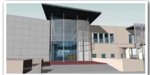
Student Services Building

“Both of these buildings will complement and expand our campus both aestheti-