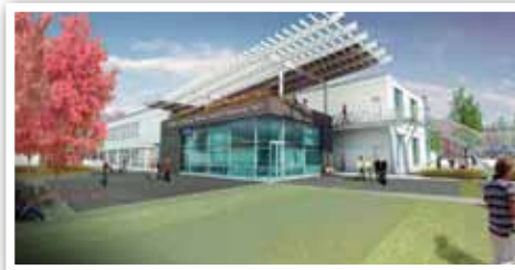
Allen & Marla Weiss Health Sciences Hall