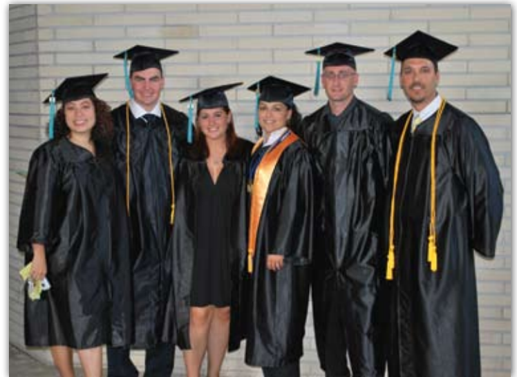
Bachelor Degree candidates gather for the May 2009 ceremony.

As a State College, Edison remains true to our core mission. We are still an open-door organization, accepting any student who earns a high school degree or its equivalent. We will meet that student at his or her