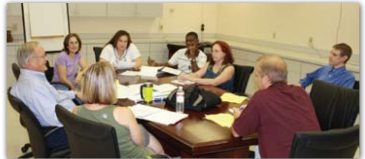
Students in the capstone class for Supervision and Management discuss final projects and how to prepare for finals.