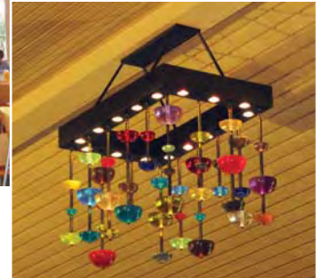
Café Chandelier (right)

To learn more about Food Services, Inc. visit