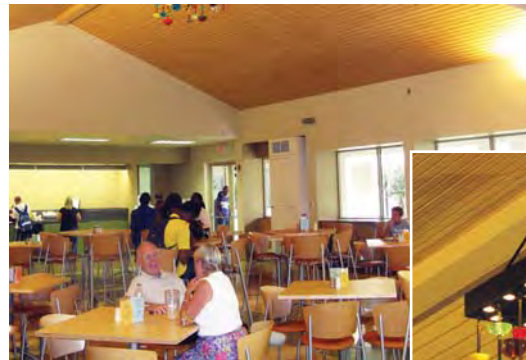
Opening day (above)