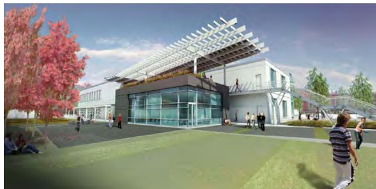
Health Sciences Hall (artist's rendition)

The Fall Semester marks the start of two new buildings on the Collier Campus. The Student Services Building will be the new home for registration, counseling, testing, the Cashier's office, and the bookstore on the first floor, with administrative offices and a community room on the second floor. The Health Sciences Hall will have nursing and related labs, classroom and administrative space on the first floor, with chemistry and biology labs, classrooms and administrative space on the second floor. An exterior patio will be on the roof.