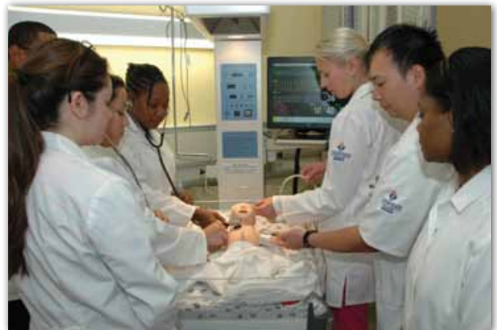
Nursing students assess skills on the high-tech manikins in the new School of Nursing building.

The state-of-the-art 58,000 square-foot building features a mock hospital, ICU, OR and pediatric unit featuring life-like manikins for simulated learning. The manikins can be programmed to sweat, cry, bleed, and react to student procedures. They allow students to work