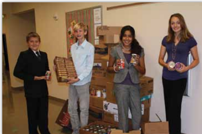
ECHS – Lee students collected 1,263 cans of food for an annual contest.