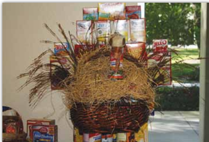
This Thanksgiving gobbler was one of the creative baskets contributed last year.